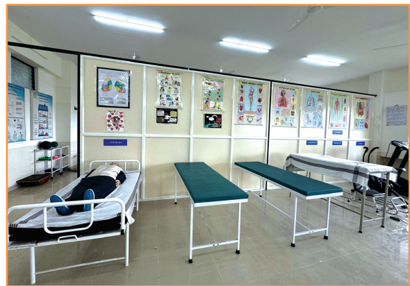
Cardiovascular & Respiratory Physiotherapy Lab